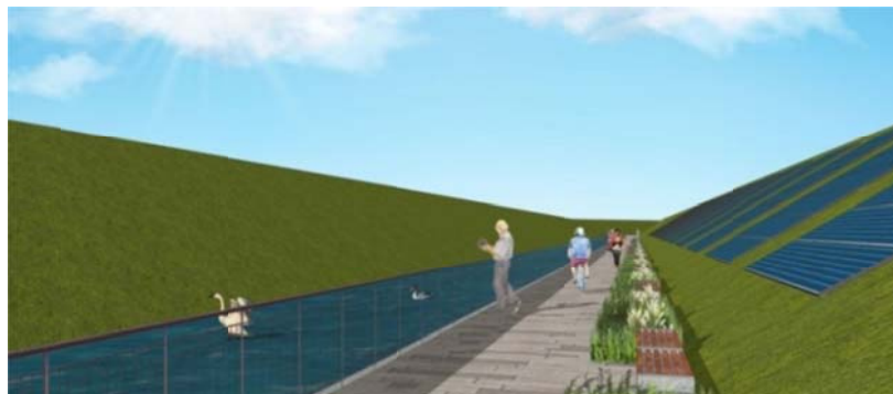
Figure 1 Super Bayou with Trail

Specifically, the RCCs are embedded into river bank/bed and replace soils with enclosed channels that contribute to an increase in water conveyance. RCC walls can be extended in order to deepen bayous further. Figure 1 shows a trail in a bayou where bikers and pedestrian enjoy clean water and green environment.